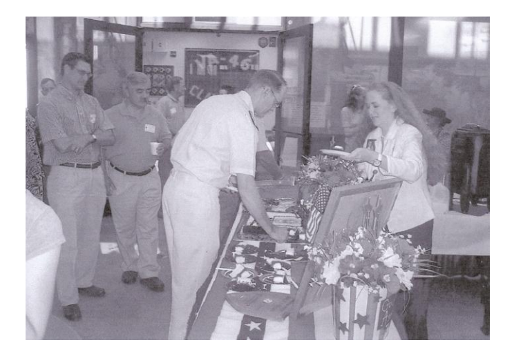
A reception was enjoyed following the dedication of the RVAH-11 "Checkertails" RA-5C Vigilante at the Navy Museum's Cold War Wing in Washington, D.C.

Some of the attendees at the dedication of the RVAH-11 "Checkertails" RA-5C Vigilante at the Navy Museum's Cold War Wing in Washington, D.C.