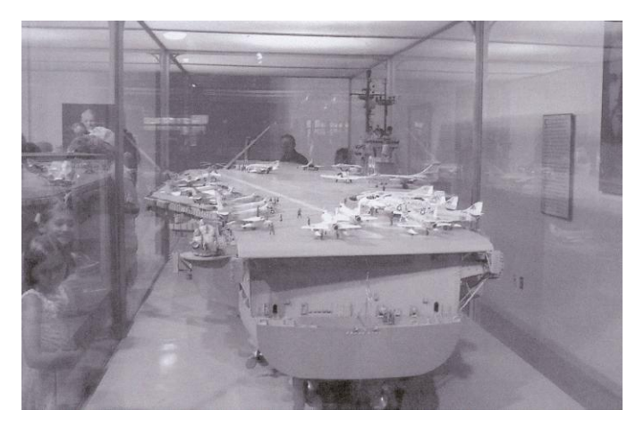
When entering the U.S. Navy Museum's new Cold War Wing, the first thing seen is this huge model of USS Forrestal (CVA-59). The model was produced by Newport News Shipbuilding during the construction of the ship. The aircraft models on the flight deck were produced and placed there in later years.

Finally, the group moved to Arlington National Cemetery for short memorial services at the USS Forrestal's mass grave (in Section 46) of 18 of the 134 men who died on 29 July 1967 and at the grave (in Section 11) of CAPT (then-LCDR) Vincent D. Monroe, USN, who was KIA 18 May 1968.